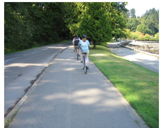
Shared Use Path