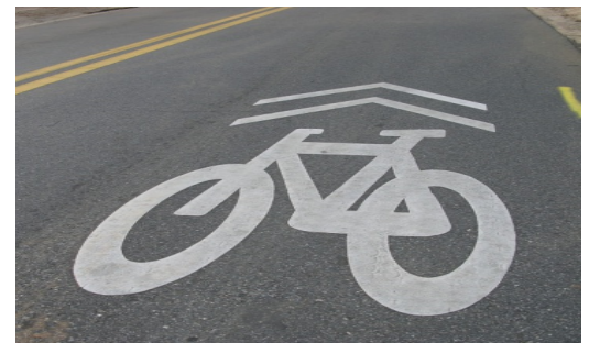
Sharrow Lane Marking

A well-marked, signed and visible corridor designed to improve bicycle and pedestrian connectivity between Charleston and North Charleston is a defining project for this Master Plan. It will enhance the functionality of the Neck area for people of all ages and abilities.